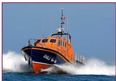
RNLI: Tamar Class Lifeboat 'Molly Hunt'

IndigoVision IP-Video technology helps to secure two Belgian airports Arecont Vision recognised by PSA Outstanding New Vendor award GigE Vision connectivity board introduced by Multipix Imaging Veteran DVR supplier Tecton announce their latest 'Icebox' storage system HD Surveillance specialist Avigilon recognised in 2010 Red Herring awards <<< Bosch rugged MIC 400 series cameras take to the seas with the RNLI Leading co-axial cable manufacturer Belden joins the HDcctv Alliance Another Chapter as the IP UserGroup Latinoamerica is announced